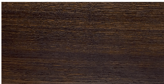
Image shows product with a coat of clear uv oil.

Should you require the information on any other details please contact the sales team on +44 (0) 20 8501 6730 or info@wfa.uk.net