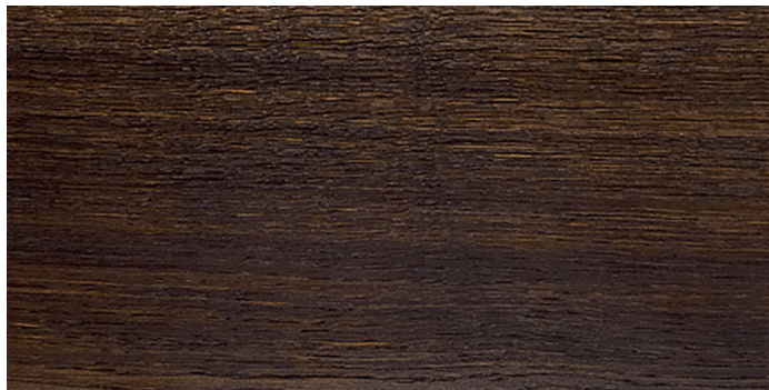
Image shows product with a coat of clear uv oil.

Should you require the information on any other details please contact the sales team on +44 (0) 20 8501 6730 or info@wfa.uk.net