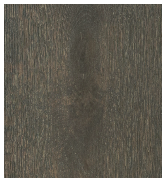
Image shows Rustic option.

Should you require the information on any other details please contact the sales team on +44 (0) 20 8501 6730 or info@wfa.uk.net