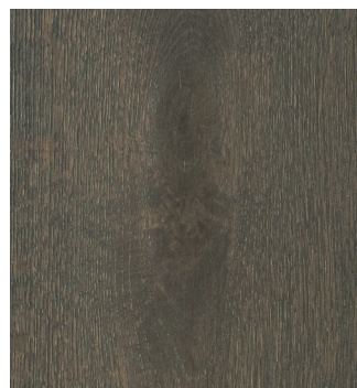
Image shows Rustic option.

Should you require the information on any other details please contact the sales team on +44 (0) 20 8501 6730 or info@wfa.uk.net