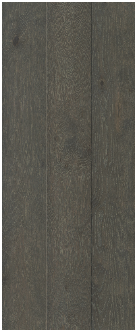
Image shows Rustic option.