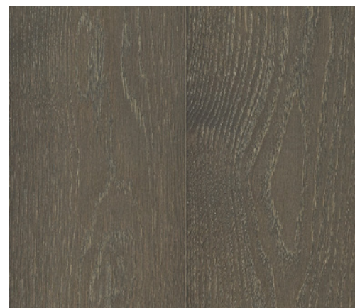
Image shows Prime option.

ALL Measurements are in mm. NOTE: Sizes shown in red are non stock items, delivery will be 7 - 10 weeks, subject to finish. ** All widths available from stock apart from 160mm & 200mm in rustic grade, this is to order.