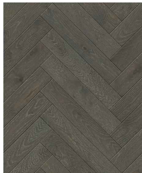
Image shows Rustic option.

The CGI images above are for representation only and do not reflect a complete floor.