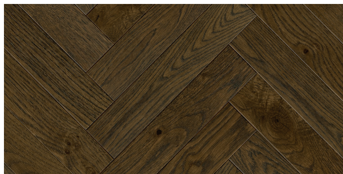
Image shows Rustic option.

Should you require the information on any other details please contact the sales team on 020 8501 6730 or info@wfa.uk.net