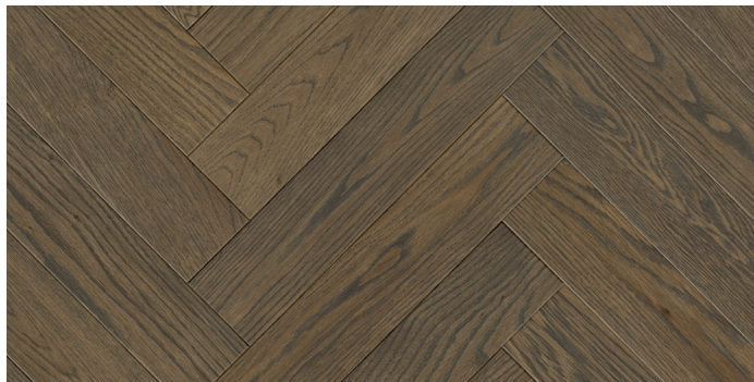
Image shows Select option.

Should you require the information on any other details please contact the sales team on 020 8501 6730 or info@wfa.uk.net