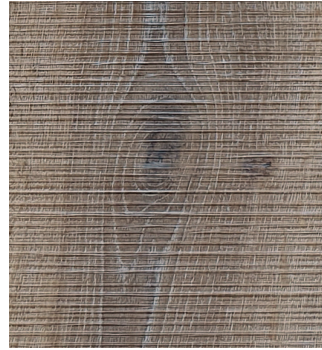
Image shows Rustic option.

Should you require the information on any other details please contact the sales team on 020 8501 6730 or info@wfa.uk.net