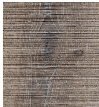
Image shows Rustic option.

Should you require the information on any other details please contact the sales team on 020 8501 6730 or info@wfa.uk.net