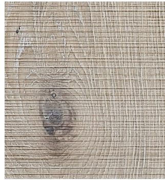
Image shows Rustic option.

Should you require the information on any other details please contact the sales team on 020 8501 6730 or info@wfa.uk.net