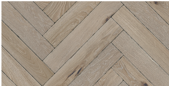
Image shows Rustic option.

Should you require the information on any other details please contact the sales team on 020 8501 6730 or info@wfa.uk.net