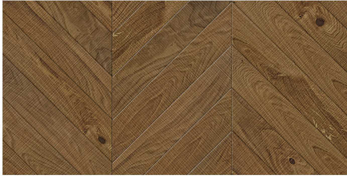
Image shows Rustic option.

Should you require the information on any other details please contact the sales team on 020 8501 6730 or info@wfa.uk.net