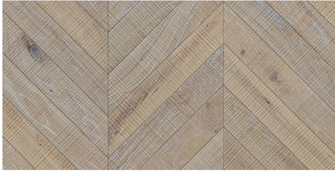
Image shows Rustic option.

Should you require the information on any other details please contact the sales team on 020 8501 6730 or info@wfa.uk.net