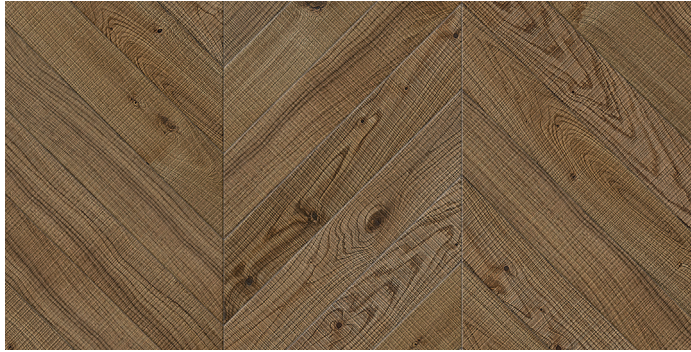
Image shows Rustic option.

Should you require the information on any other details please contact the sales team on 020 8501 6730 or info@wfa.uk.net