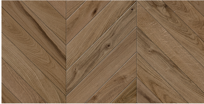
Image shows Rustic option.

Should you require the information on any other details please contact the sales team on 020 8501 6730 or info@wfa.uk.net