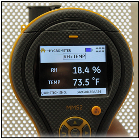
Figure 4: MMS2 as a Hygrometer

Relative humidity and temperature measurements are made with the Hygrostick, Quikstick or Short Quikstick probe, and the MMS2 instrument uses these values to calculate a range of psychometric readings. When using the MMS2 to measure the conditions in air, the humidity probe is normally connected directly to the instrument. However, when it is impractical or awkward to use the instrument in this way, the extension lead may be used to connect the Hygrostick, Quikstick or Short Quikstick to the instrument. Typically, the extension lead will be used when taking readings from probes that have been embedded in structures such as walls and floors.