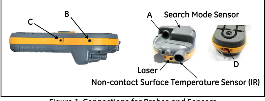
Figure 1: Connections for Probes and Sensors

D - This USB socket is for connection to a PC when using the optional MMS2 logging software.