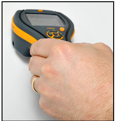
Figure 2: Using the Pin Moisture Meter

Use the up and down buttons / to navigate between different wood types. From Wood Type B to Wood Type H, if MC% is greater than 30.0, ABOVE FIBER SAT will be displayed as the wood status, otherwise the wood status will not be displayed. When using the built-in pins, the operator should make firm contact on the surface. It is not necessary or recommended to push the pins deeply below the surface.