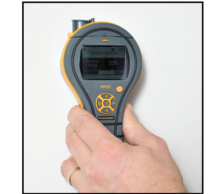
Figure 3: Taking Relative Moisture Readings

Note: When holding the meter at the bottom, away from any objects, it should not show any reading.