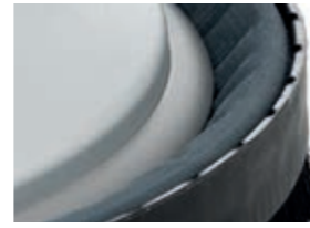
Dust protection skirt on cover plate is self-adjusting in height