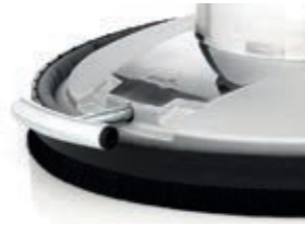
Handles on the cover plate make it easy to carry