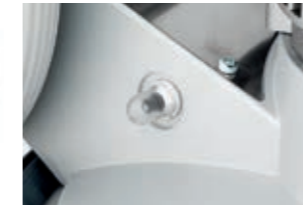
Thermal and power overload fuse ensures operational safety