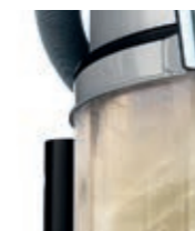
Unique 2-step cyclonic filter separation process