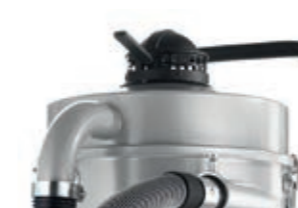
Pressure release valve for easy filter clearing