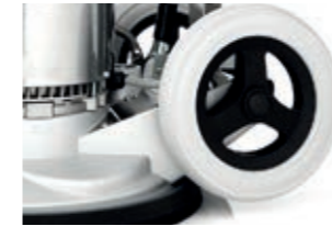
Large wheels for easy transportation