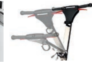
Folding and stepless shaft adjustment for easy handling