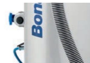
Fully sealed system keeps indoor air perfectly clean