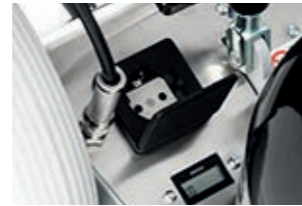
Power outlet for optional accessories