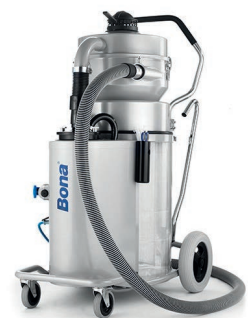
For optimal dust reduction use Bona DCS 70