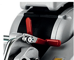
Easily accessible controls