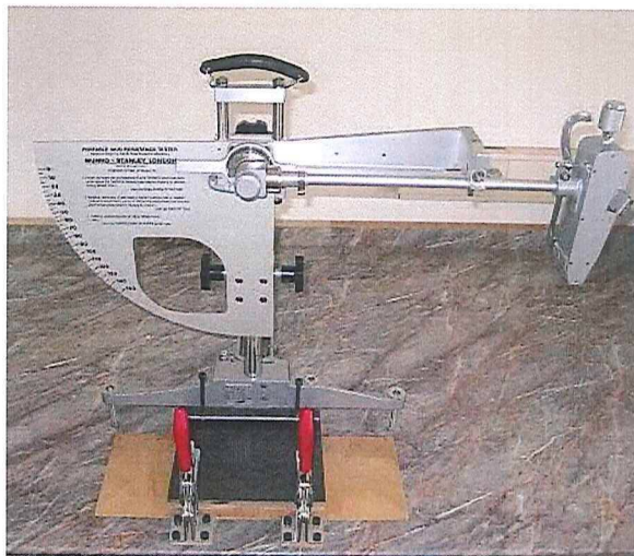
Fig. 1: Portable Skid Resistance Tester SRT 5800

The determination of the slip resistance was carried out according to BS 7976-2:2002 by pendulum test under dry and wet conditions with a Portable Skid Resistance Tester SRT 5800 (Fig. 1) with the rubber slider 96 (4S) on 10 samples. For each sample 8 tests were done. The test was carried out under laboratory conditions at 23 °C and 50 % relative humidity.