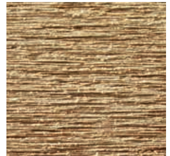
The surface that has been sanded by Bona Abrasives is smoother, more even, with visibly less fibre ripping.