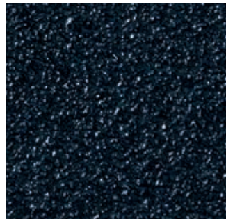
Sanding particles are close together and more evenly distributed.